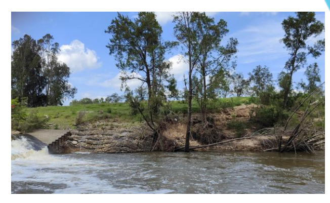
Erosion on the west bank of Camden Weir will be repaired

There will be increased heavy vehicle movement to the work sites at the weirs. Large rocks will be delivered by truck to stabilise the riverbanks at each site.