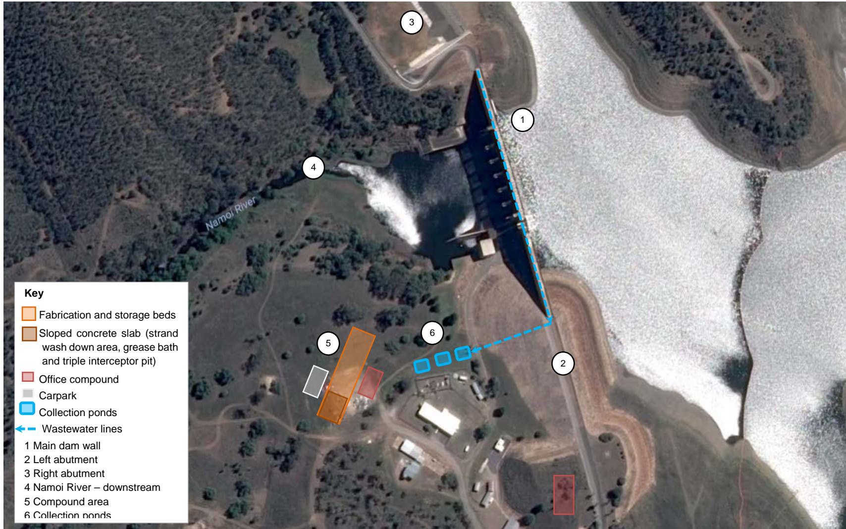
Figure B-1 Wastewater lines and collection ponds