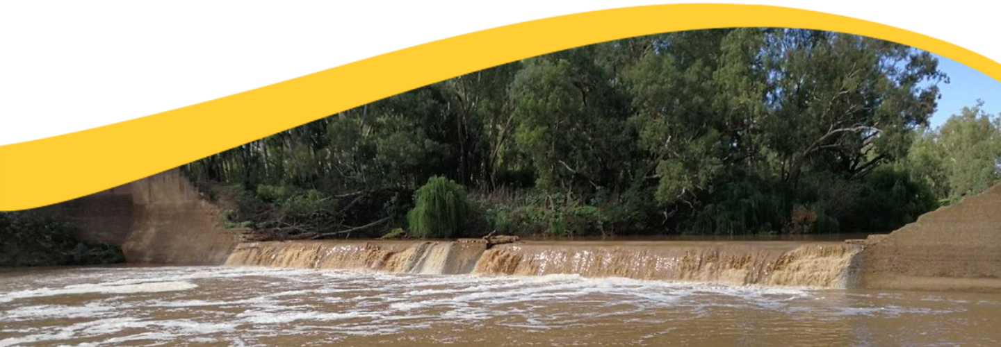
Photo: Macquarie River at Gin Gin Weir