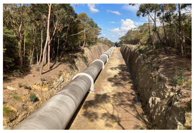
A section of the pipeline.

The pipeline is surrounded by a drainage system to protect the structure and surrounding assets during wet weather events. Upgrades will include repair and replacing the drainage system along the pipeline corridor, cleaning out debris, and scour protection.